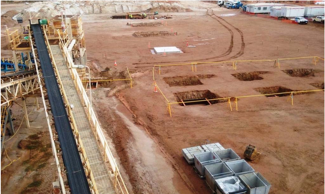
Figure 3 | Excavations for foundations