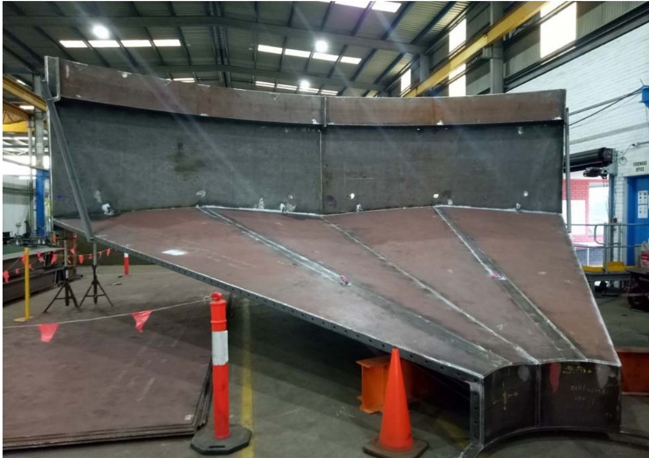
Figure 6 | Thickener fabrication progress - Trial assembly of first two pie sections