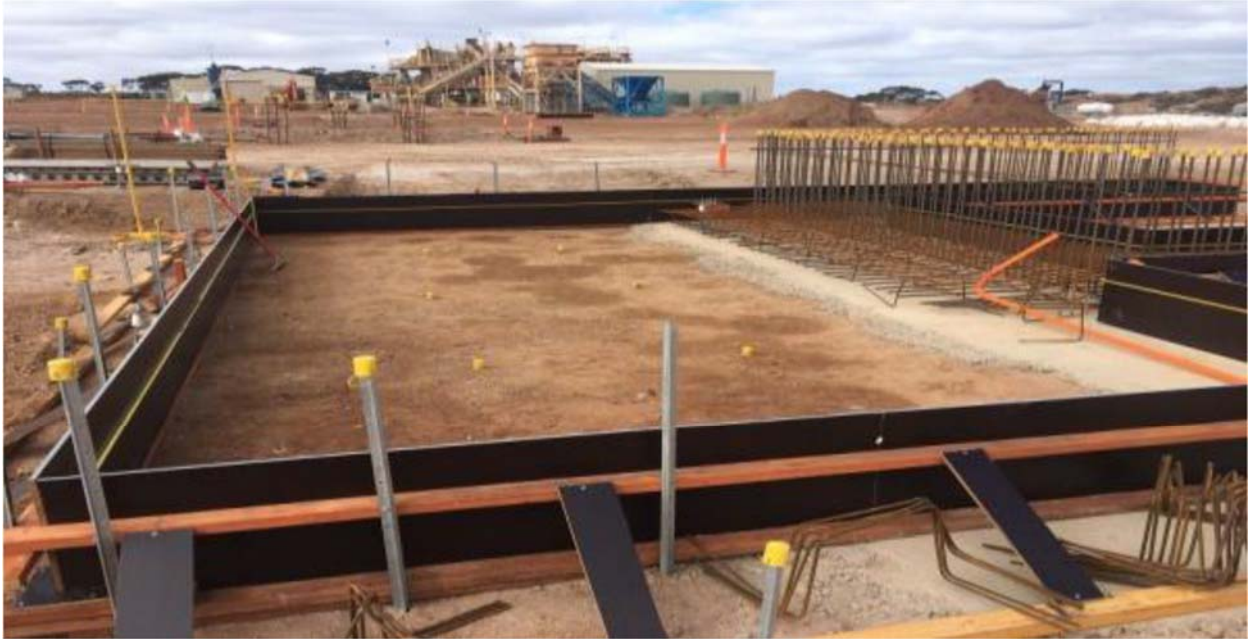
Figure 2 | Feed bin slab north end ready for blinding