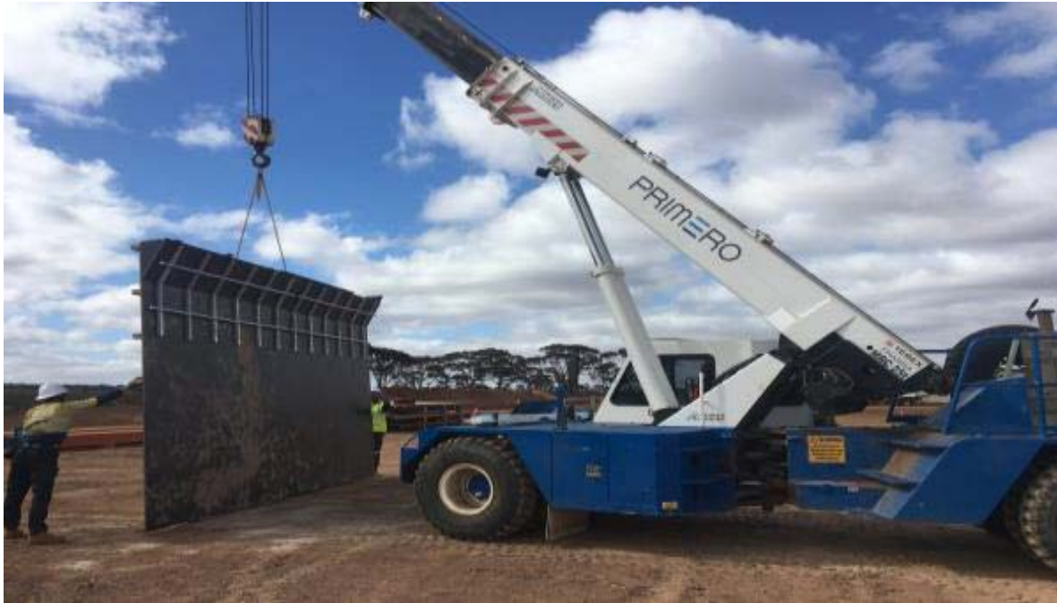
Figure 4 | Continue with cast in bar & shutter fabrication