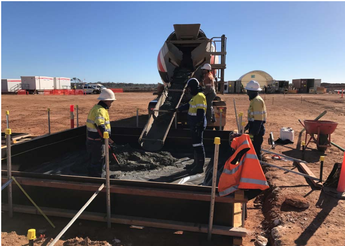
Figure 5 | First concrete pour - Take up tower curing