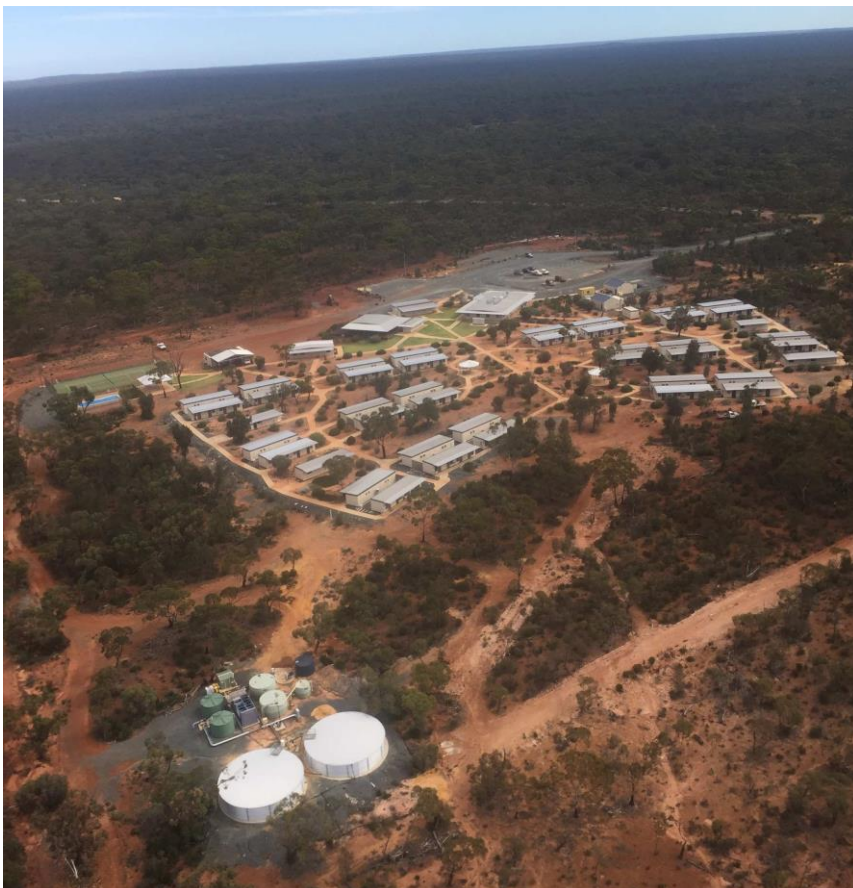
Figure 3 | Aerial view of the Lanfranchi Camp.

The camp is located approximately 40km from the Bald Hill Lithium and Tantalum Mine and significantly reduces the Company's upfront capital costs. The Company will assess the merits of expanding the current 40 room camp at Bald Hill after production has commenced.