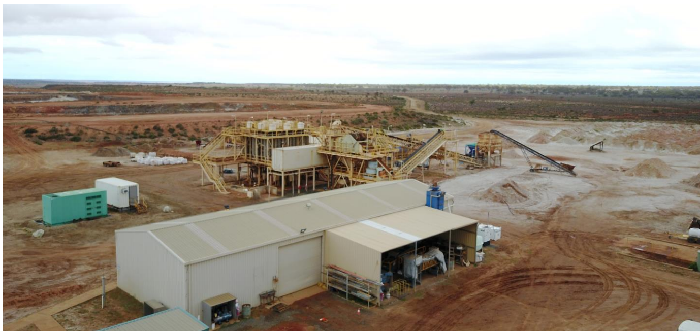
Figure 1 - Bald Hill Tantalum Plant. The proposed Spodumene Concentrator will be located to the right of the photo.

In June 2017, the Company is expected to commence site clearing on existing disturbed areas ready for construction and early operations, including mobilisation of key construction personnel to site.